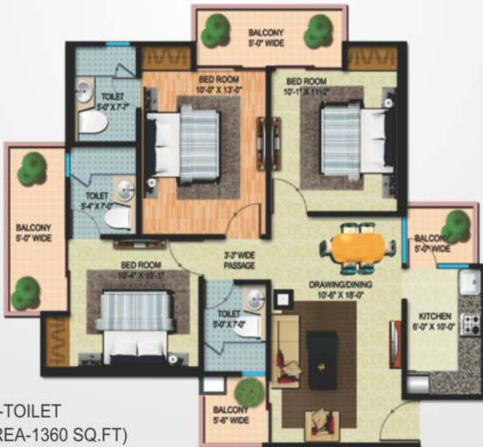
3 B.H.K., 3-TOILET (SUPER AREA-1360 SQ.FT)