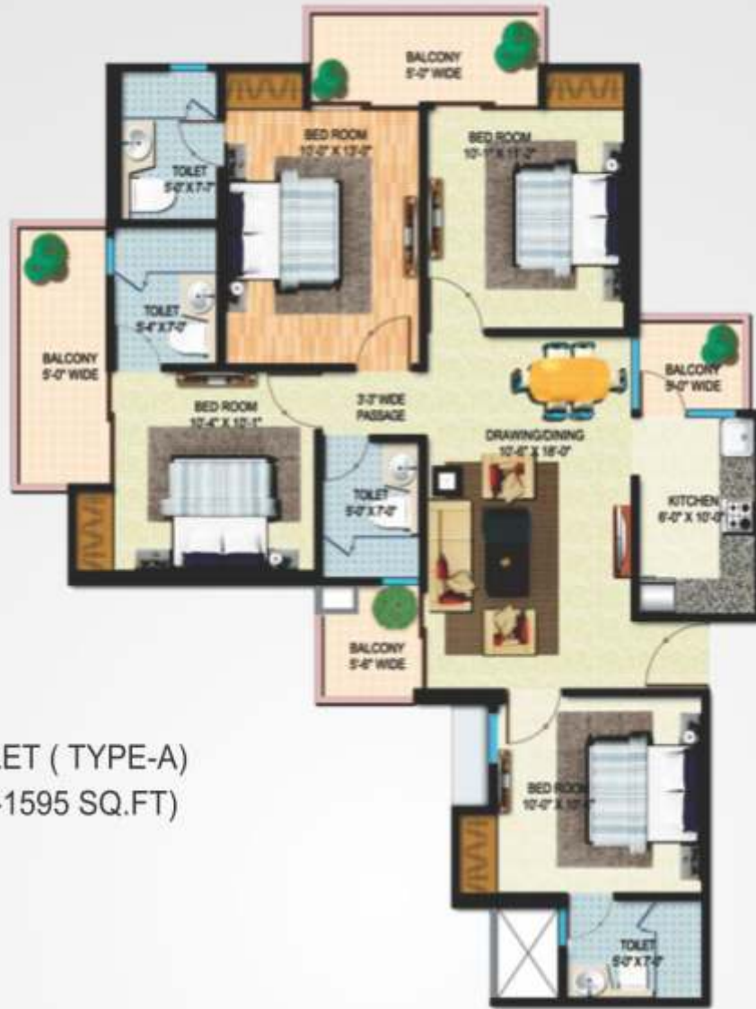
4 B.H.K. 4-TOILET ( TYPE-A) (SUPER AREA-1595 SQ.FT)