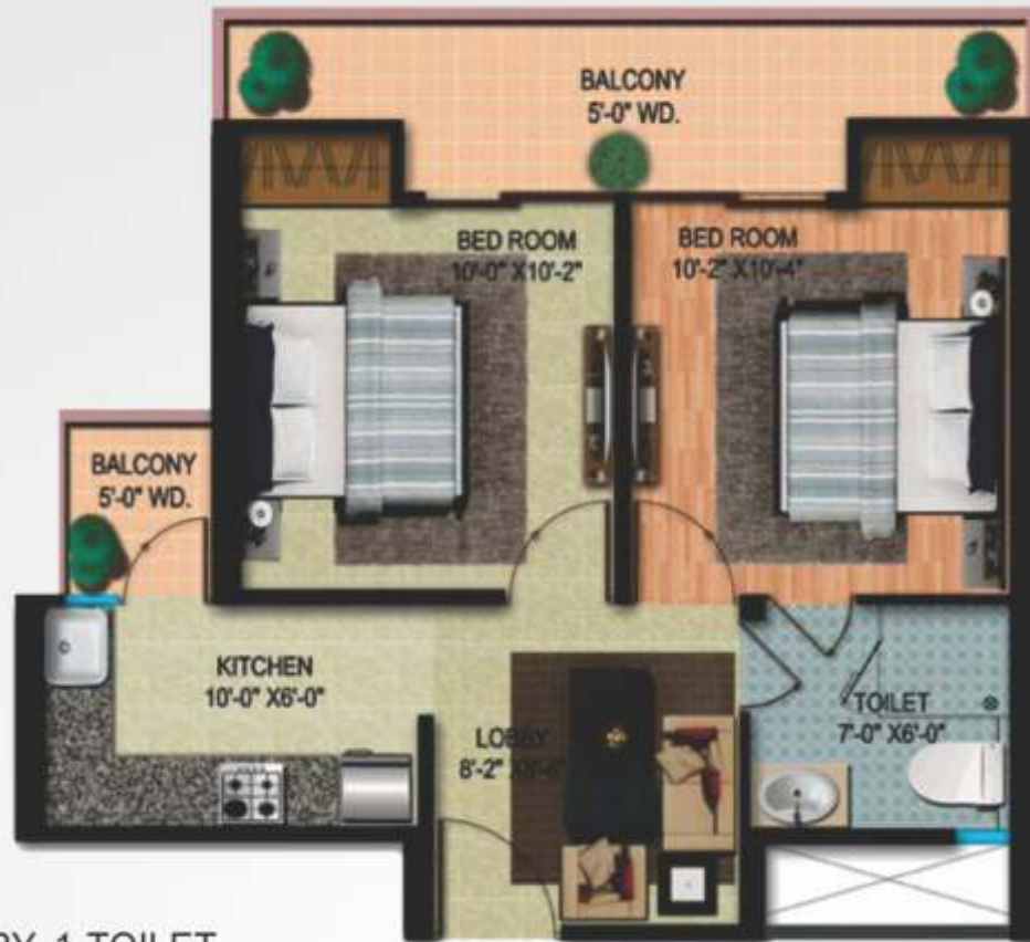
2 B.H.K. LOBBY, 1-TOILET (SUPER AREA-695 SQ.FT)