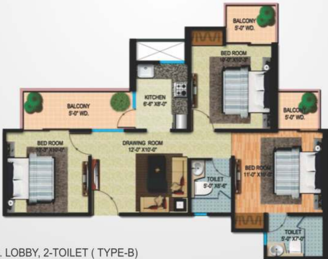
3 B.H.K. LOBBY, 2-TOILET ( TYPE-B) (SUPER AREA-995 SQ.FT)