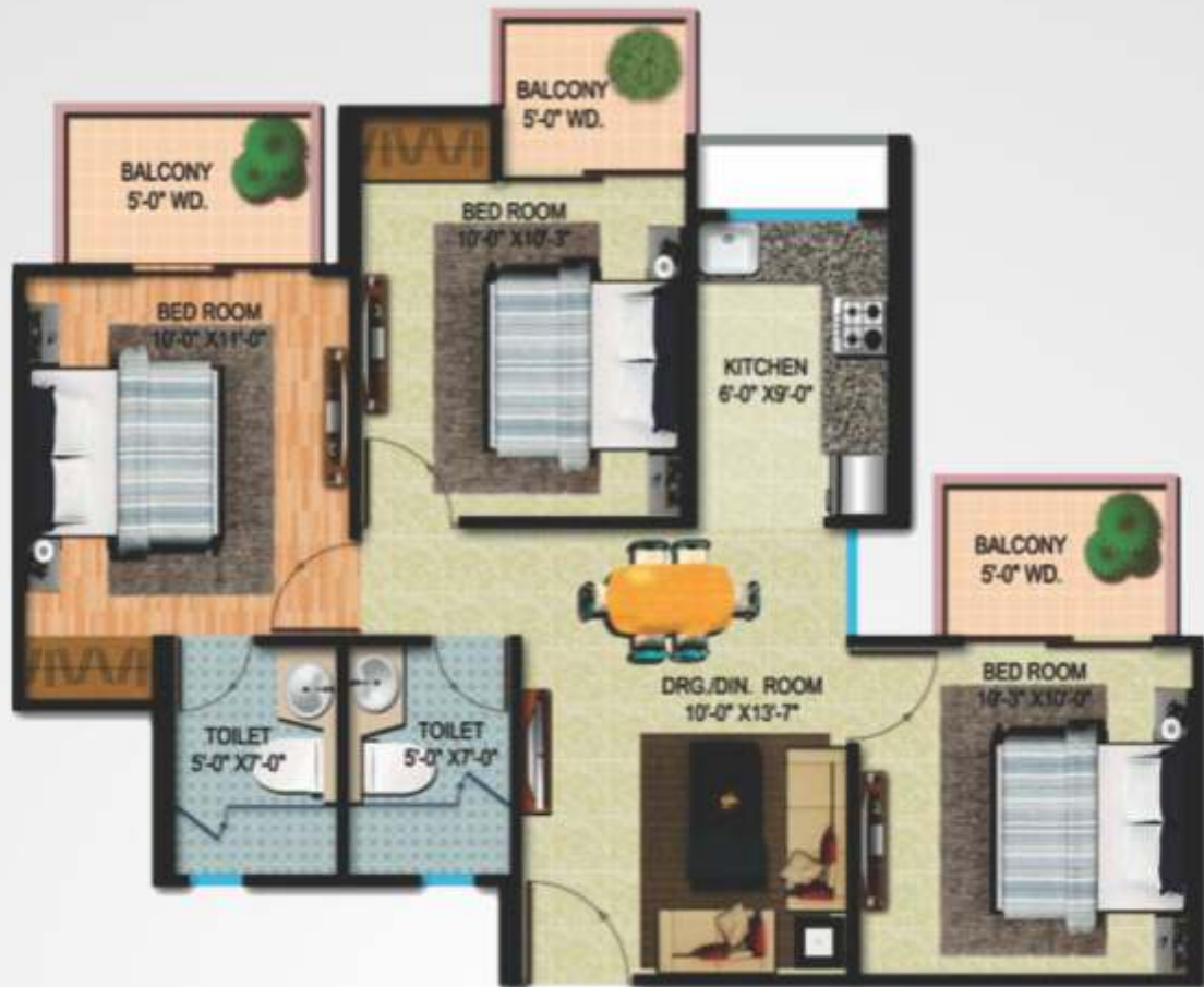
3 B.H.K. 2-TOILET ( TYPE-A) (SUPER AREA-995 SQ.FT)