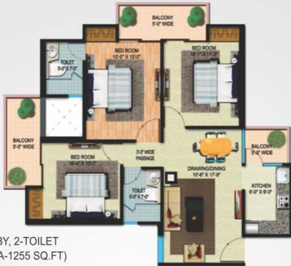
3 B.H.K. LOBBY, 2-TOILET (SUPER AREA-1255 SQ.FT)