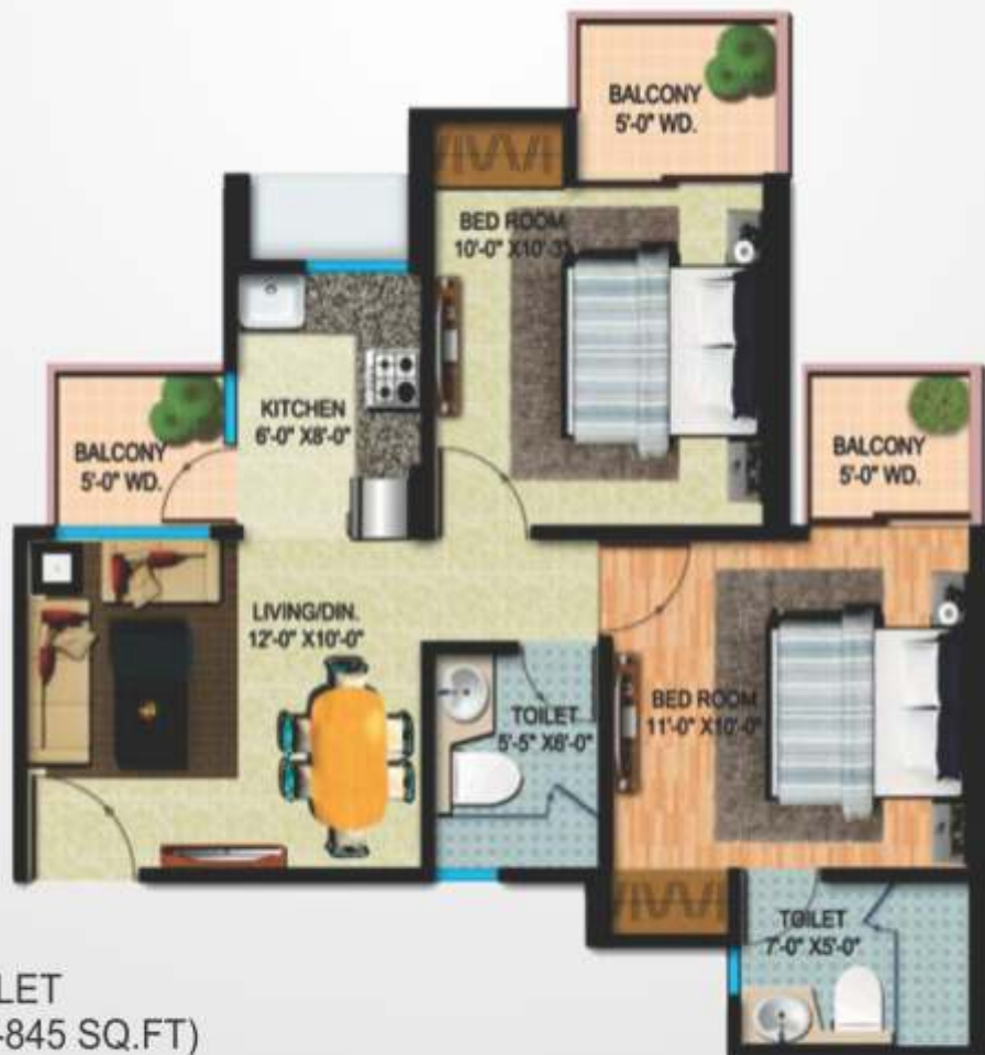
2 B.H.K. 2-TOILET (SUPER AREA-845 SQ.FT)